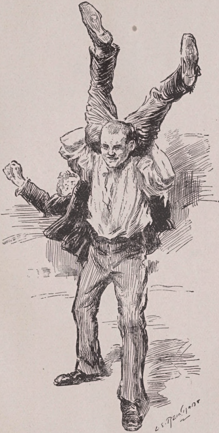
Billy kicked and struggled, but Cully held him